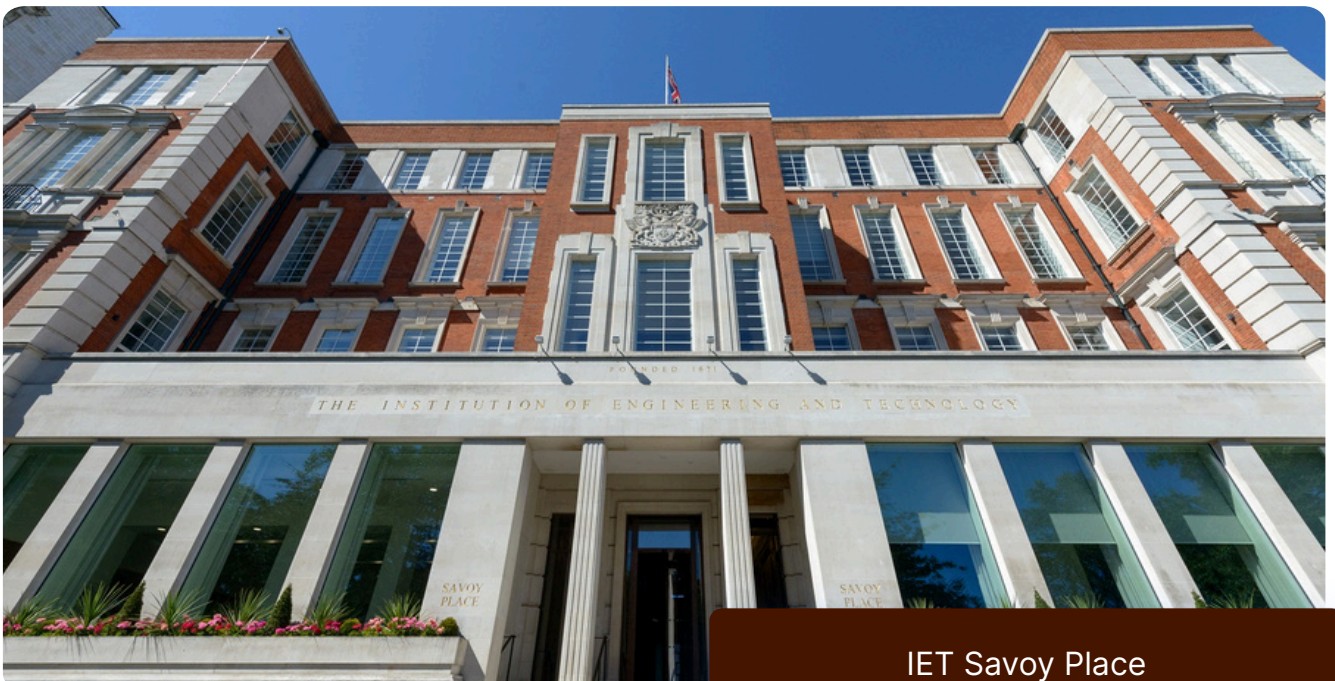
IET Savoy Place