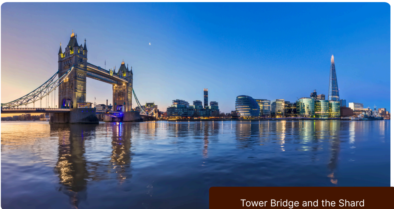
Tower Bridge and the Shard