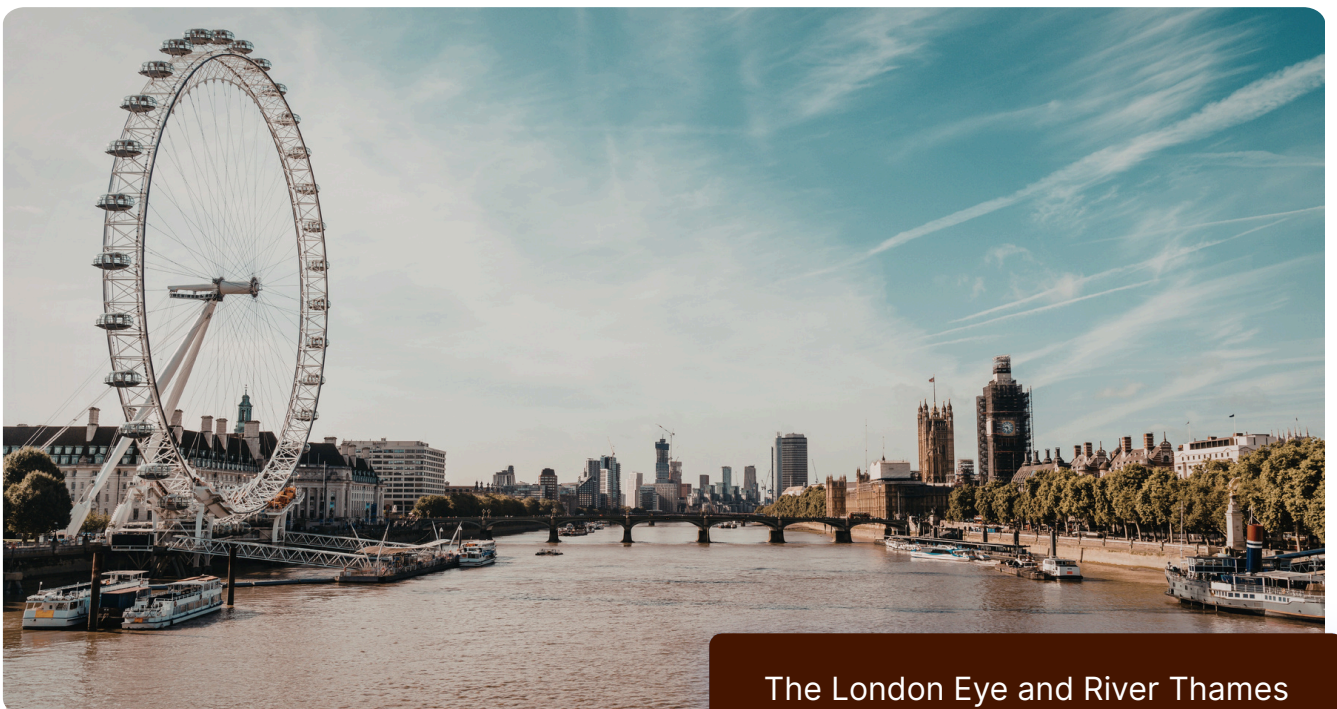
The London Eye and River Thames